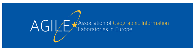
Figure 2. The logo of AGILE – the Association of Geographic Information Laboratories in Europe.

Figures and tables can be placed in a single column, or span over both columns if required. The figure caption names the number of the figure as indicated in the example. Reference to figures in text shall use abbreviations like Fig. 1, where a non-breaking space is added before the number. The caption of the figure spells out Figure 1.